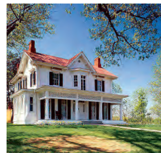
The hilltop Frederick Douglass National Historic Site

This museum showcases the War on Drugs campaign, brought to you by the Drug Enforcement Administration. Exhibits cover the last 150 years of drug abuse, addiction and drug law enforcement, including Nancy Reagan's "Just Say No" commercials from the 1980s and relics from old opium dens ( deamuseum.org ; 700 Army Navy Dr., entrance on S. Hayes Street; 10am–4pm Tue–Fri, closed Sat–Mon; free).