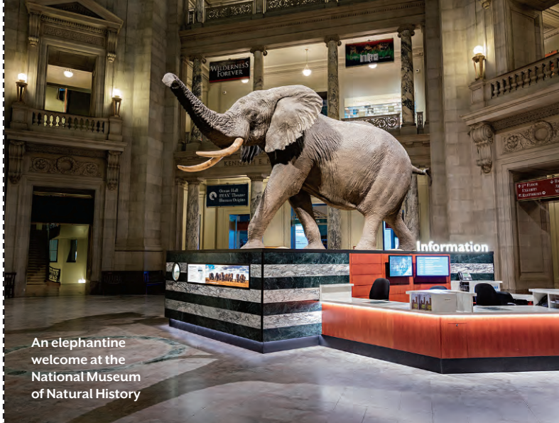
An elephantine welcome at the National Museum of Natural History