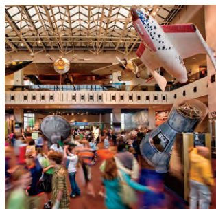
See milestones of flight at the National Air and Space Museum

This museum inspires kids with moon rocks, spaceships and wild simulator rides. Everyone flocks to see the 1903 Wright brothers' flyer, Amelia Earhart's red 5B Vega and the Apollo 11 Command Module, Columbia. There's also an annex 31 miles away in Chantilly, Va. ( airandspace.si.edu ; corner 6th Street & Independence Avenue SW; 10am–5:30pm, see website for extended hours; free).