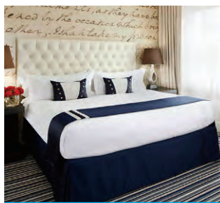
The George is one of the top boutique hotels in Washington

1 On a shady residential street in the lively suburb of Adams Morgan, Adam's Inn has inviting, homey rooms in two adjacent townhouses and a carriage house, plus a garden patio ( adamsinn.com ; 1746 Lanier Place NW; from $99).