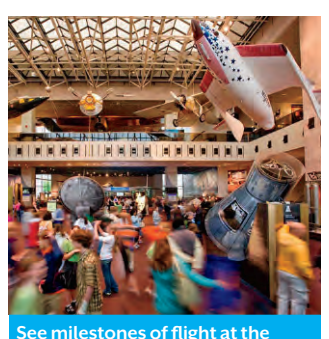
See milestones of flight at the National Air and Space Museum

This museum inspires kids with moon rocks, spaceships and wild simulator rides. Everyone flocks to see the 1903 Wright brothers' flyer, Amelia Earhart's red 5B Vega and the Apollo 11 Command Module, Columbia. There's also an annex 31 miles away in Chantilly, Va. ( airandspace.si.edu ; corner 6th Street & Independence Avenue SW; 10am–5:30pm, see website for extended hours; free).