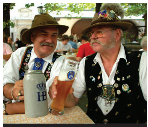
MINI GUIDE Beer Halls of Munich