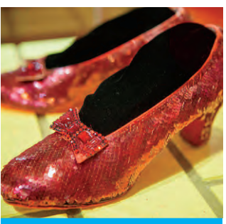
Ruby slippers at the National Museum of American History

This harrowing museum deepens understanding of the Holocaust – its victims, perpetrators and bystanders. The galleries use artifacts, historic film footage and witness testimonies. Between March and August, you will need a timed pass to see the permanent exhibition: book well ahead online ( ushmm.org ; 100 Raoul Wallenberg Place SW; 10am–5:20pm; entry free; online advance timed pass, $1).